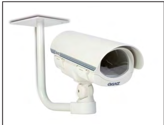
GH-F on ceiling mount GH-CM2

Naturally, various accessories are also available, such as ceiling and wall mounts and adapters for mounting on poles.